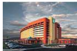
Embassy Suites Hotel Albuquerque, NM

Un Pueblo Unido: Creciendo Juntos One Community: Growing Together